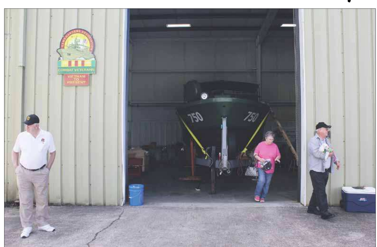
Members of the Gamewardens Association walk past a patrol boat river, or PBR, that was used in service in the Vietnam War. This PBR, service number 750, is used by the Gamewardens in parades and events such as the Portland Rose Festival.

MOVED: Gamewardens Association Celebrates New Location in Building Leased from Port of Chehalis