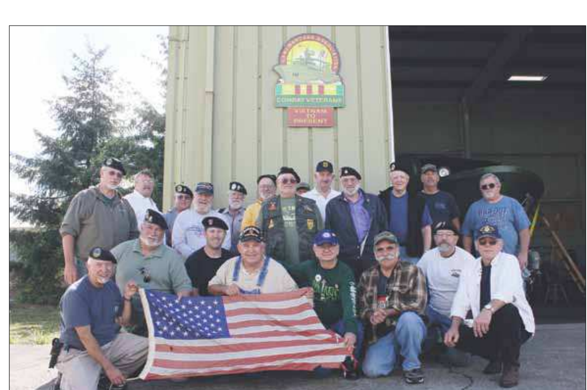
Members of the Gamewardens Association gather for a portrait Saturday under their logo on the outside of a warehouse they are renting on Habein Road in Chehalis.